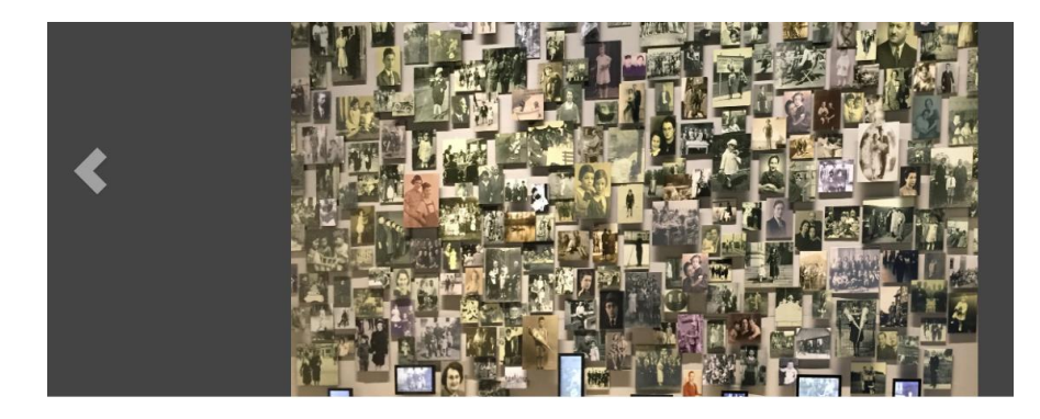
Download pdf of slideshow images and text.

In some spots, you will be able to find additional information or document. For example, in the History, Heritage and Hope gallery showing individuals affected by the Holocaust, there is a pdf document with some of the highlighted stories.